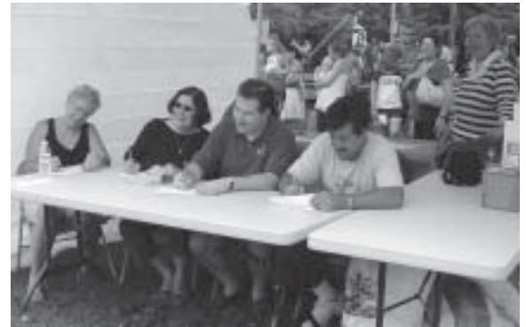
Our wonderful judges!

Kudos to the volunteers who represented and served the Chamber at the Pennridge Community Day celebration at Lake Lenape Park by judging and tallying the results of the Baby Parade. On an overcast day in the park, the Pennridge Community was blessed with many, many volunteer organizations who worked together to help make this a wonderful event for all of us. Hundreds of people joined in the celebration and took part in the events that were offered. The Pennridge Chamber took responsibility for the baby parade and had a fun time trying to pick winners in the different categories!