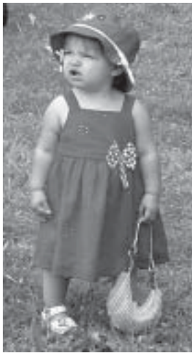
This cutie was dressed to the Tee