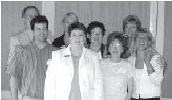
The graduates of the Class of 2008!