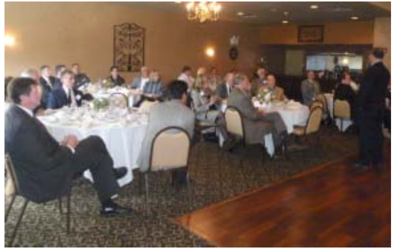
A group from the Pennridge Chamber and the Upper Bucks Chamber gathered at Revivals Restaurant for a Legislative Luncheon to receive updates from local government officials.