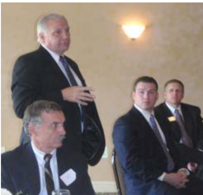
Senator Bob Mensch fielded a question.