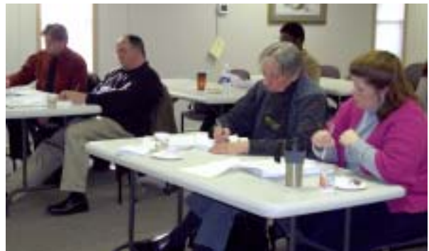
Class participants listened to a panel presentation on Health Care in Bucks County.